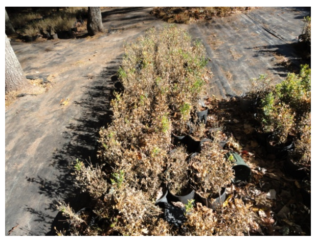
Figure 1: Symptoms of defoliation caused by C. pseudonaviculatum.