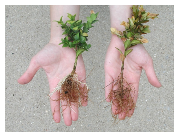
Figure 8: Browning of boxwood roots and foliage caused by Phytophthora root rot.