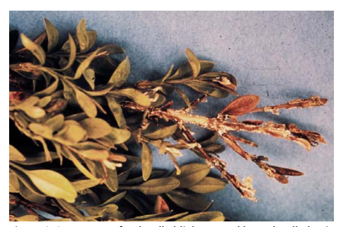
Figure 6: Symptoms of Volutella blight caused by Volutella buxi on boxwood. Note spore masses on stem.