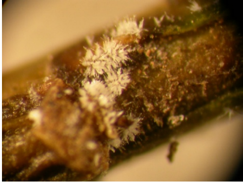
Figure 3: White stellate spore masses of C. pseudonaviculatum on a boxwood stem.