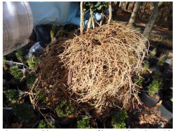
Figure 5: Healthy root system of boxwood on plant with boxwood blight.