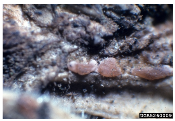
Figure 7: Salmon-colored spore masses of Volutella buxi on boxwood stem (image courtesy of Florida Division of Plant Industry Archive, Florida Department of Agriculture and Consumer Services, Bugwood.org).