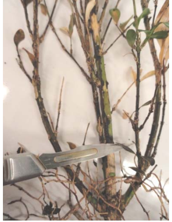
Figure 2: Dark stripes on stems, caused C. pseudonaviculatum .